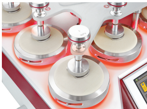
Fabric Abrasion: flat woven, knitted and nonwoven fabric

The Martindale can be used for Fabric Abrasion, Fabric Pilling, Sock Abrasion, Leather Abrasion, Edge Abrasion, Testing Floor Coverings, Toothbrush Testings and Other Specialized Testings including Custom Configurations.