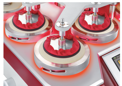
Fabric Pilling: woven and knitted fabric