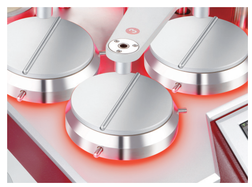
Edge Abrasion: shirt collars, cuffs, backpack straps and related items