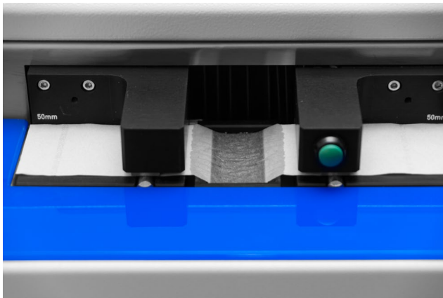
Figure: Water bath for wet tensile measurements. Measurements for up to 50 mm wide stripes possible. The tensile test ranges from 50 mm to 180 mm distance between the clamps.