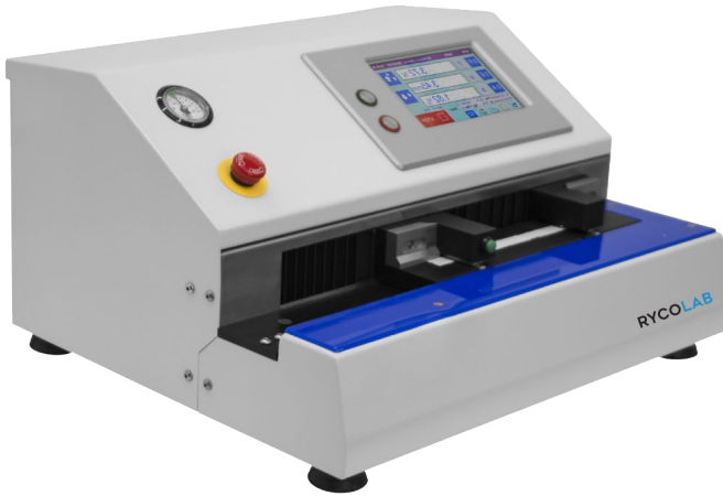
Figure: Tensile tester with integrated wet basket for tissue samples