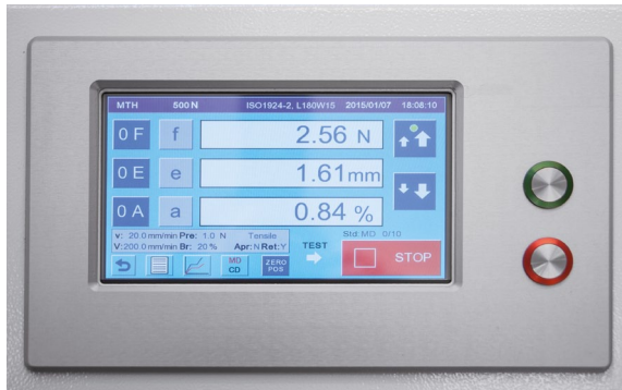
Display of the tensile tester with two separate buttons for Start and Stop.