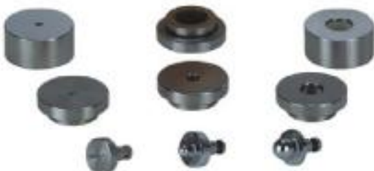
Fig. 1 Test Tools

This Sheet and Strip Metal Testing Machine is especially designed for an easy and quick quality conformance inspection and quality control on sheet and strip metal, but also particularly suitable for production monitoring because of its sturdy construction.