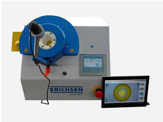
Fig. Modell 202 EM mit Digital-Mikroskop und Tablet (15970132)

A 10" tablet and software are included in the scope of supply.