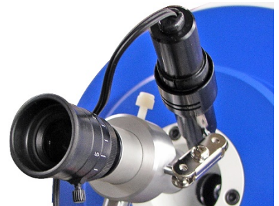
Fig. Microscope (02350132)

For the purpose of observing the test area and deciding when a crack has formed, the use of a microscope with integrated illumination is recommended. Before the forming process has started the microscope is focused on the illuminated surface. It is not necessary to adjust the microscope during the cupping process as the microscope holder moves in synchronisation with the drawing piston.