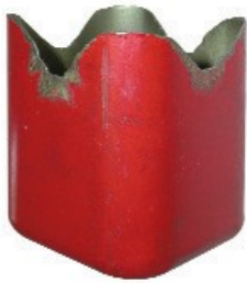
Square Cup Test