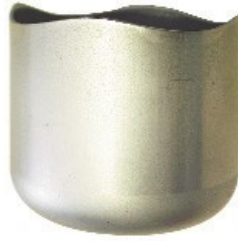
Deep-drawing Cup Test