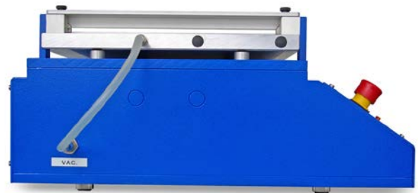
Fig. Mod. 510 Basic-V

testing equipment for quality management