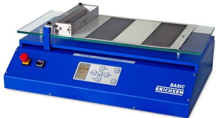
Fig. Mod. 510 Basic-G