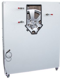
RIMpact I – Impact cabinet (for Mod. 508 SAE or VDA)