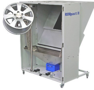
RIMpact II-VDA Impact cabinet (for Mod. 508 VDA)