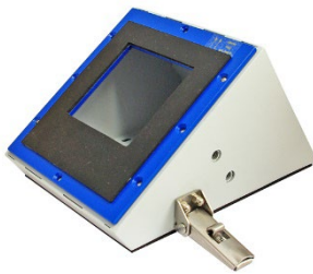
Attachment for tests in accordance with PSA D24 1312 (for Mod. 508 VDA)