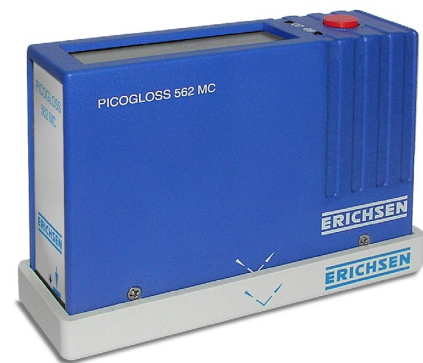
PICOGLOSS 562 MC

The PICOGLOSS 562 MC is operated by two round cells, the capacity of which is adequate for at least 10,000 measurements. When using a PC, the power supply is taken over by the USB interface of the PC.