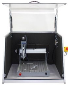
Sound Protection Housing (Option)