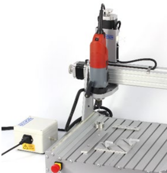
Heavy Duty (HD) Equipment (Option)